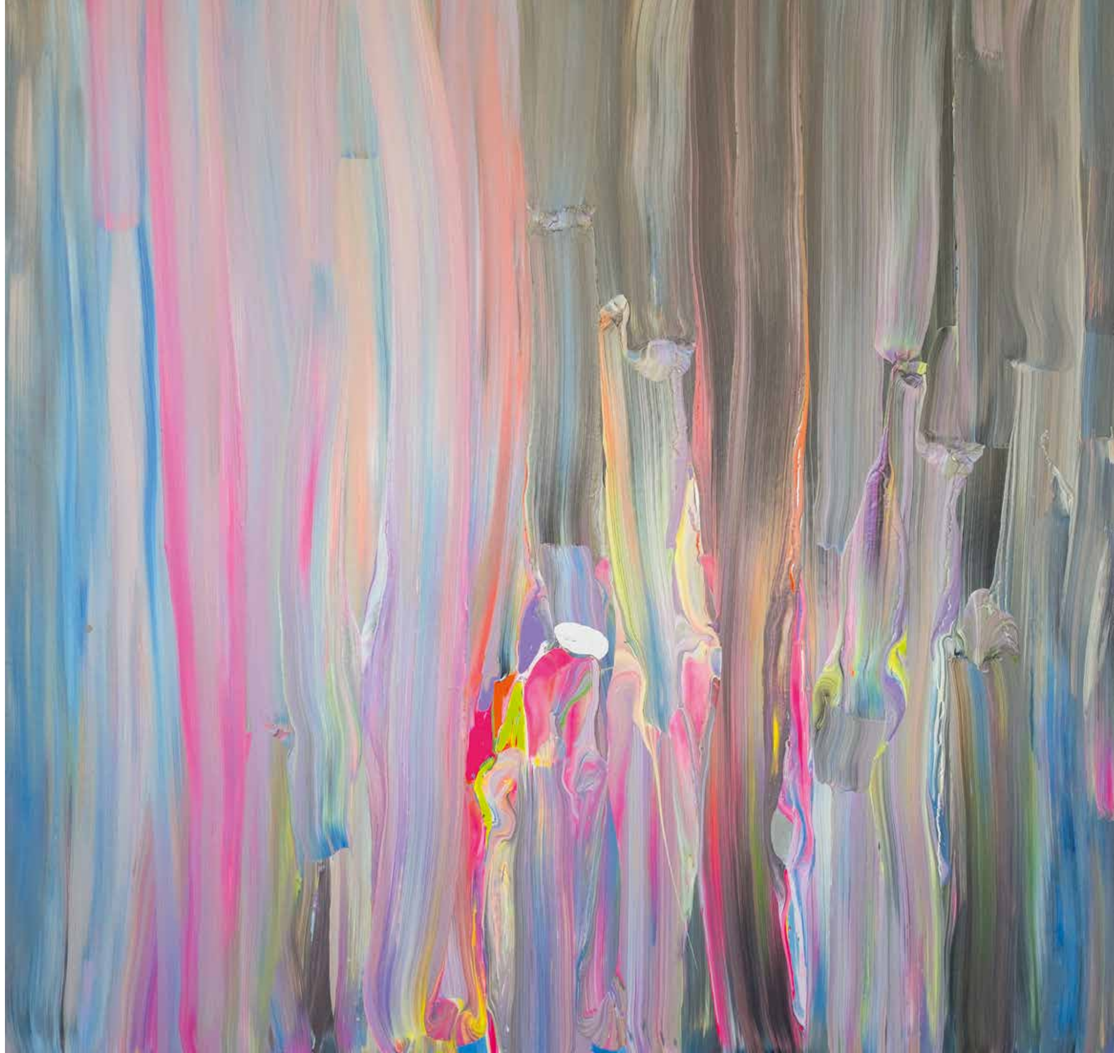
That's it, 2022 200x200 cm, acrylic on canvas