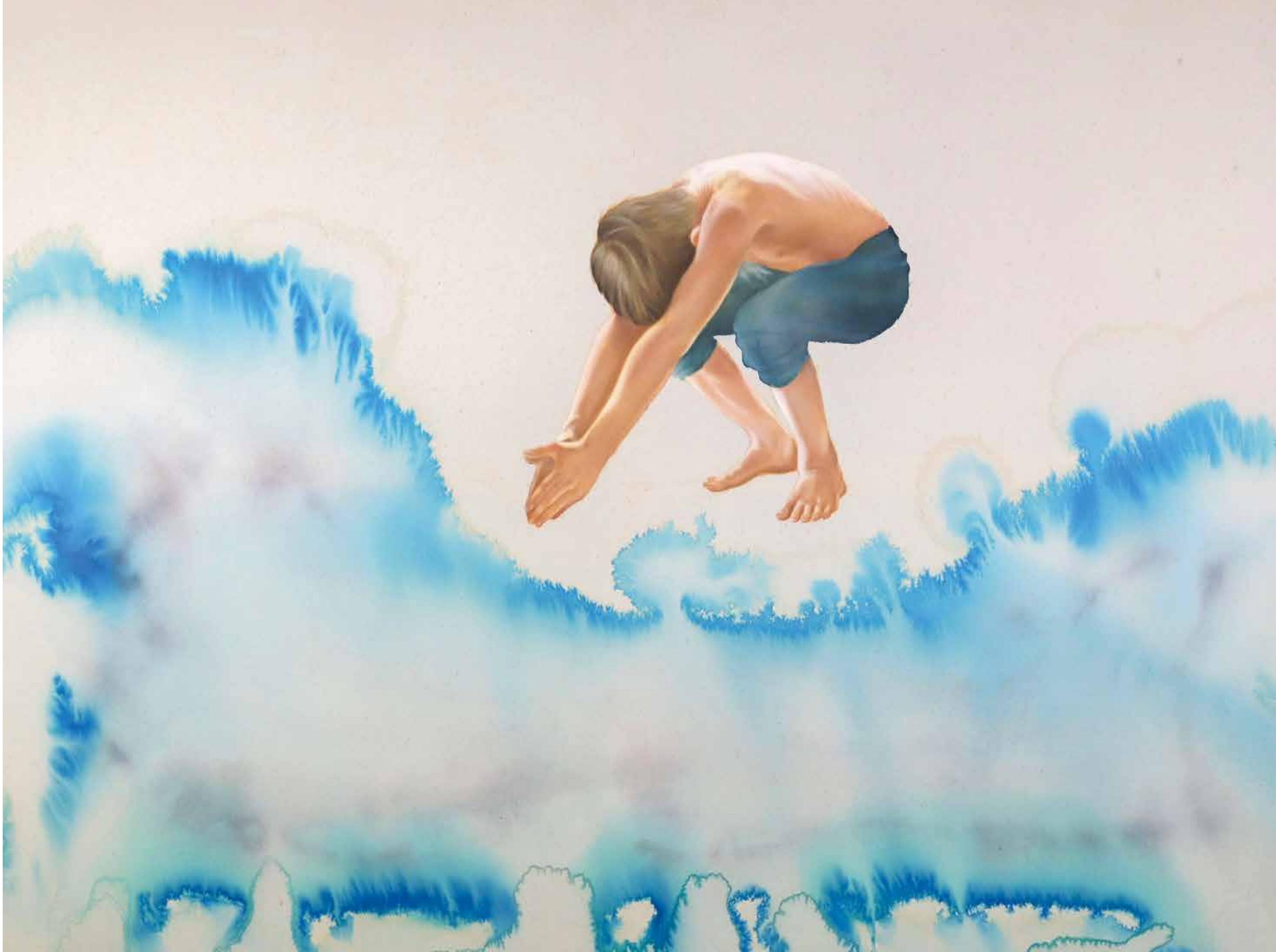
Tiefsprung , 2019 100x140cm, acrylic on untreated canvas