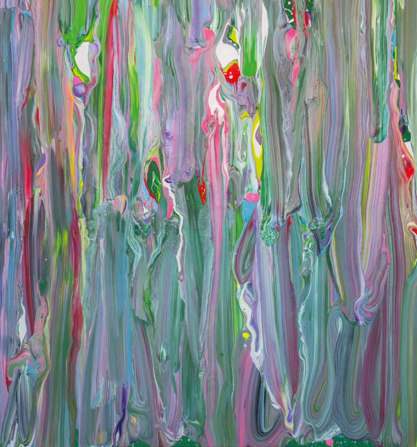
L'accomplissement, 2022 150x140 cm, acrylic on canvas