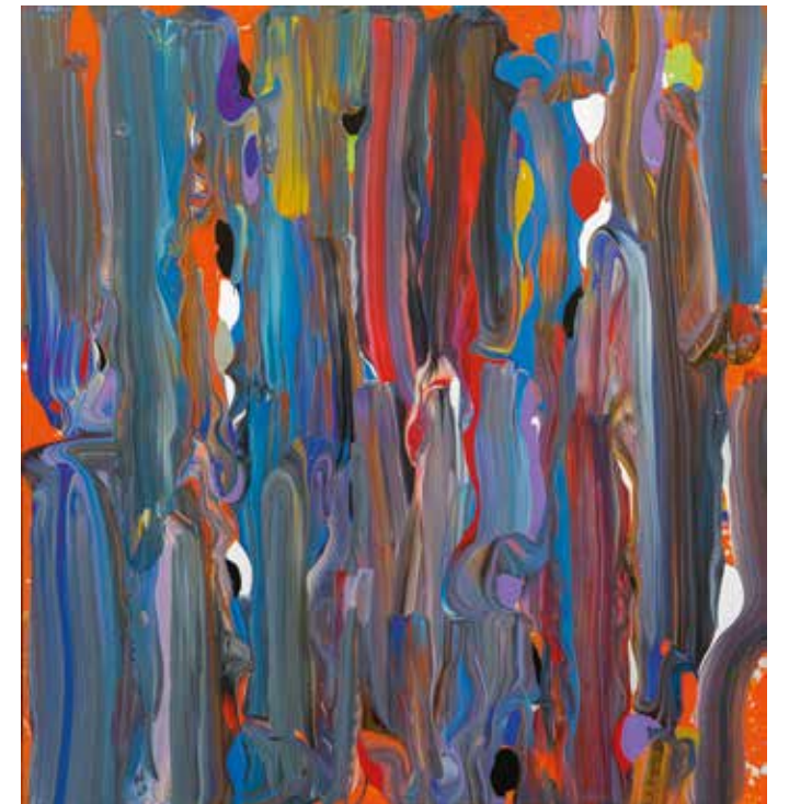
I love you so , 2022 150x140 cm, acrylic on canvas