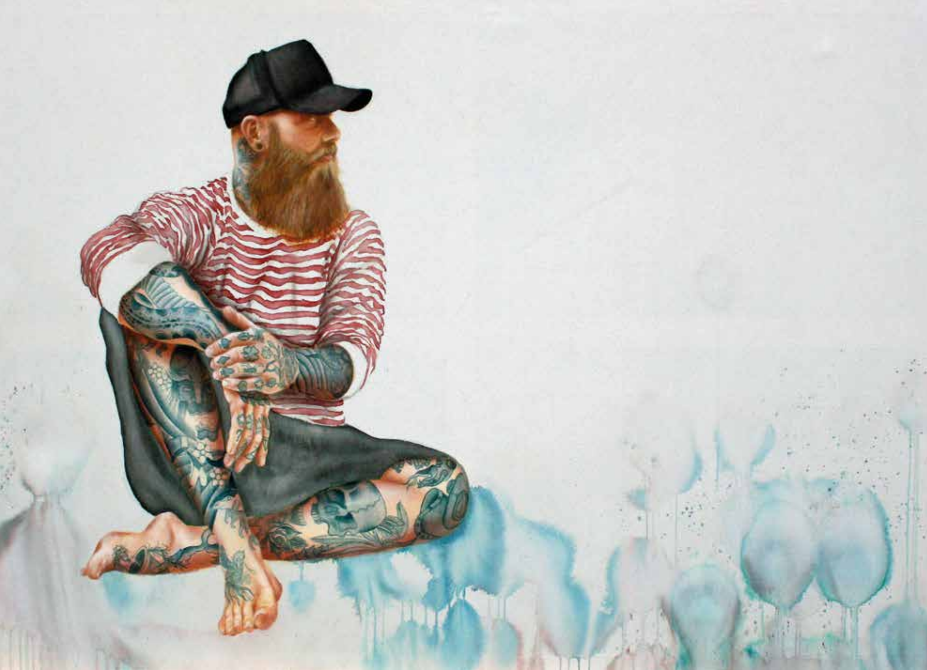
Dreh dich nicht um III...., 2018 100x140 cm, acrylic on untreated canvas