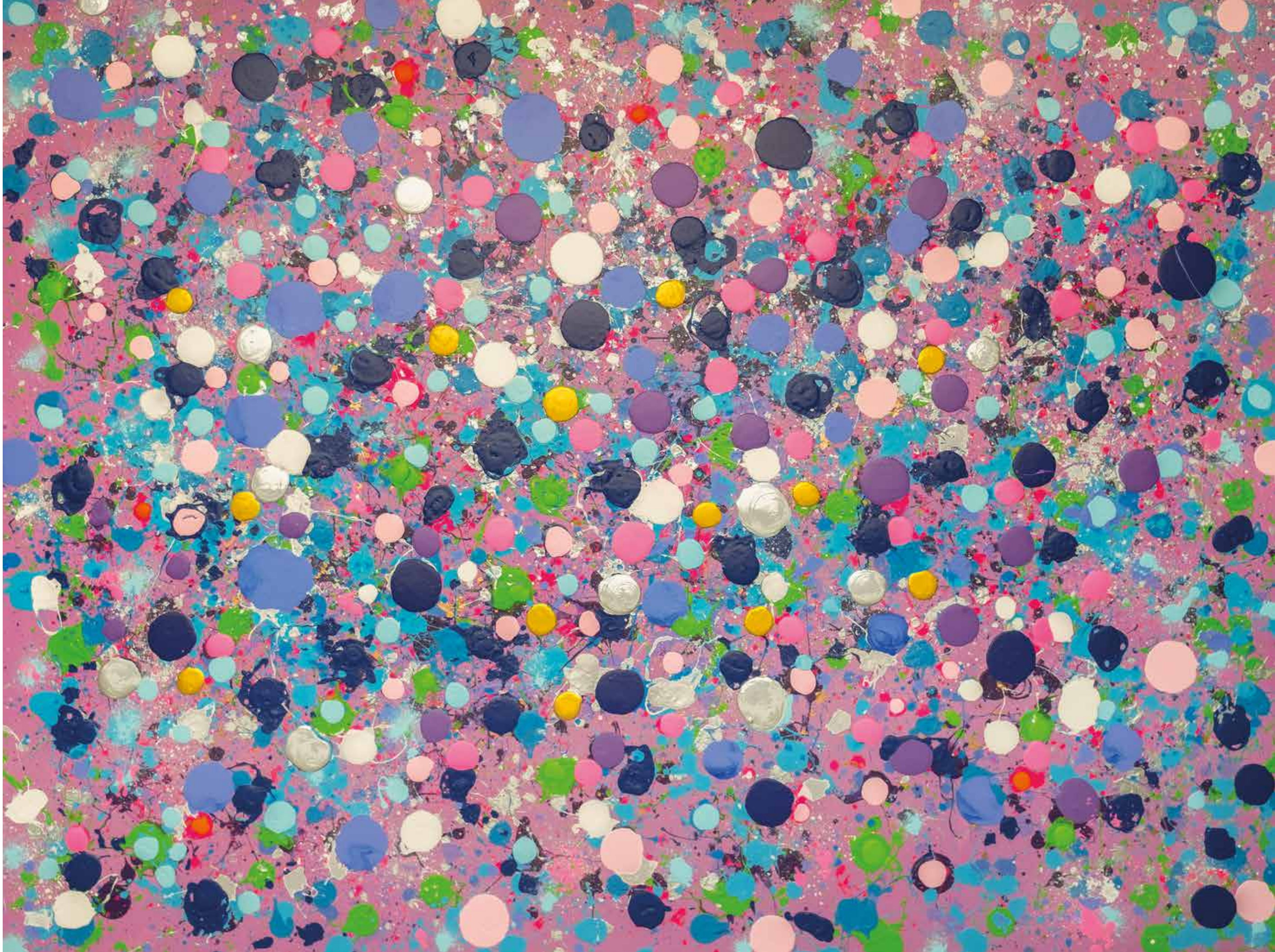
Run , 2022 180x240 cm, acrylic on canvas