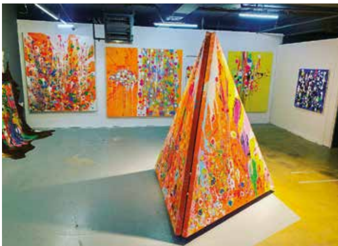
> White light , 2022 150x130 cm, acrylic on canvas