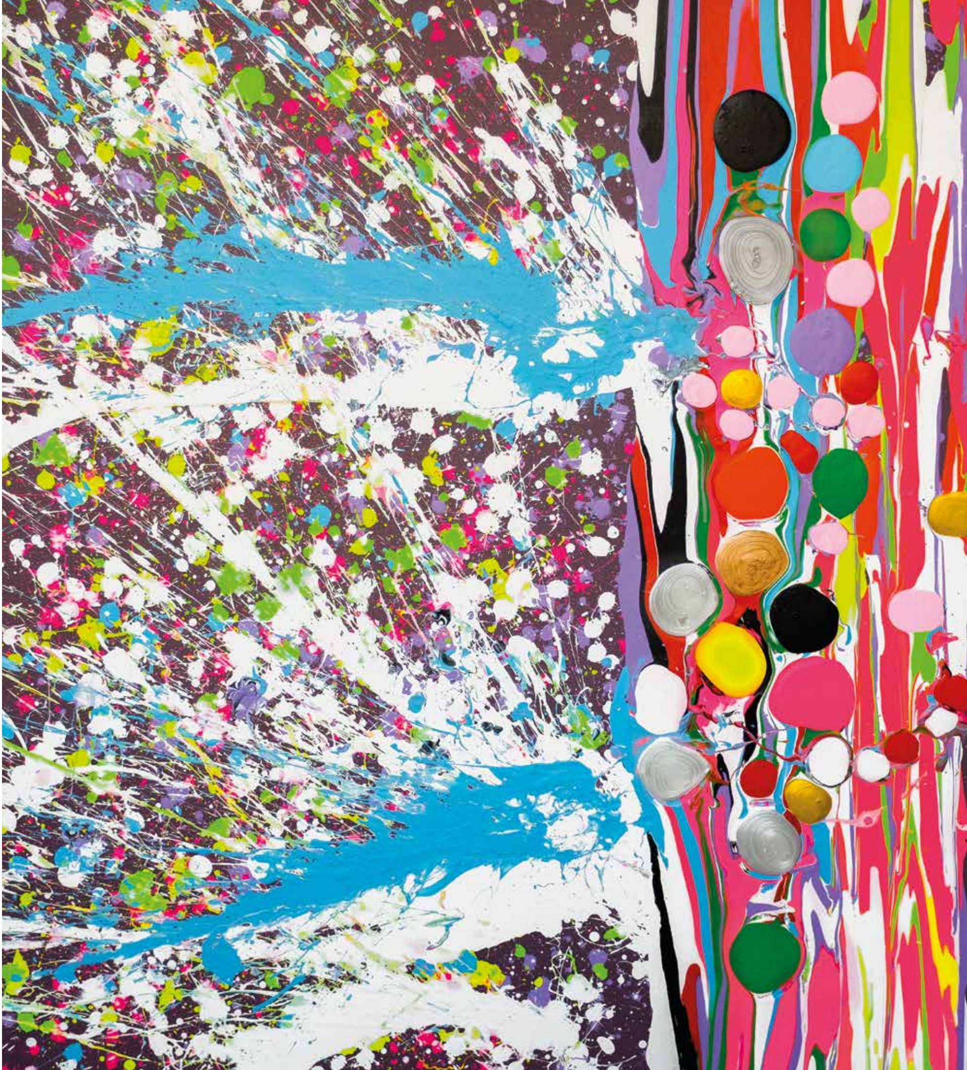
> Getting away with it, 2022 150x130 cm, acrylic on canvas