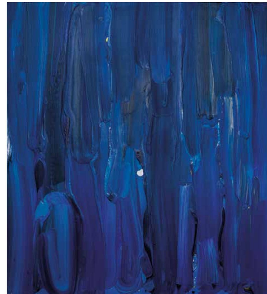
Dream of the Brave, 2022 130x120 cm, acrylic on canvas