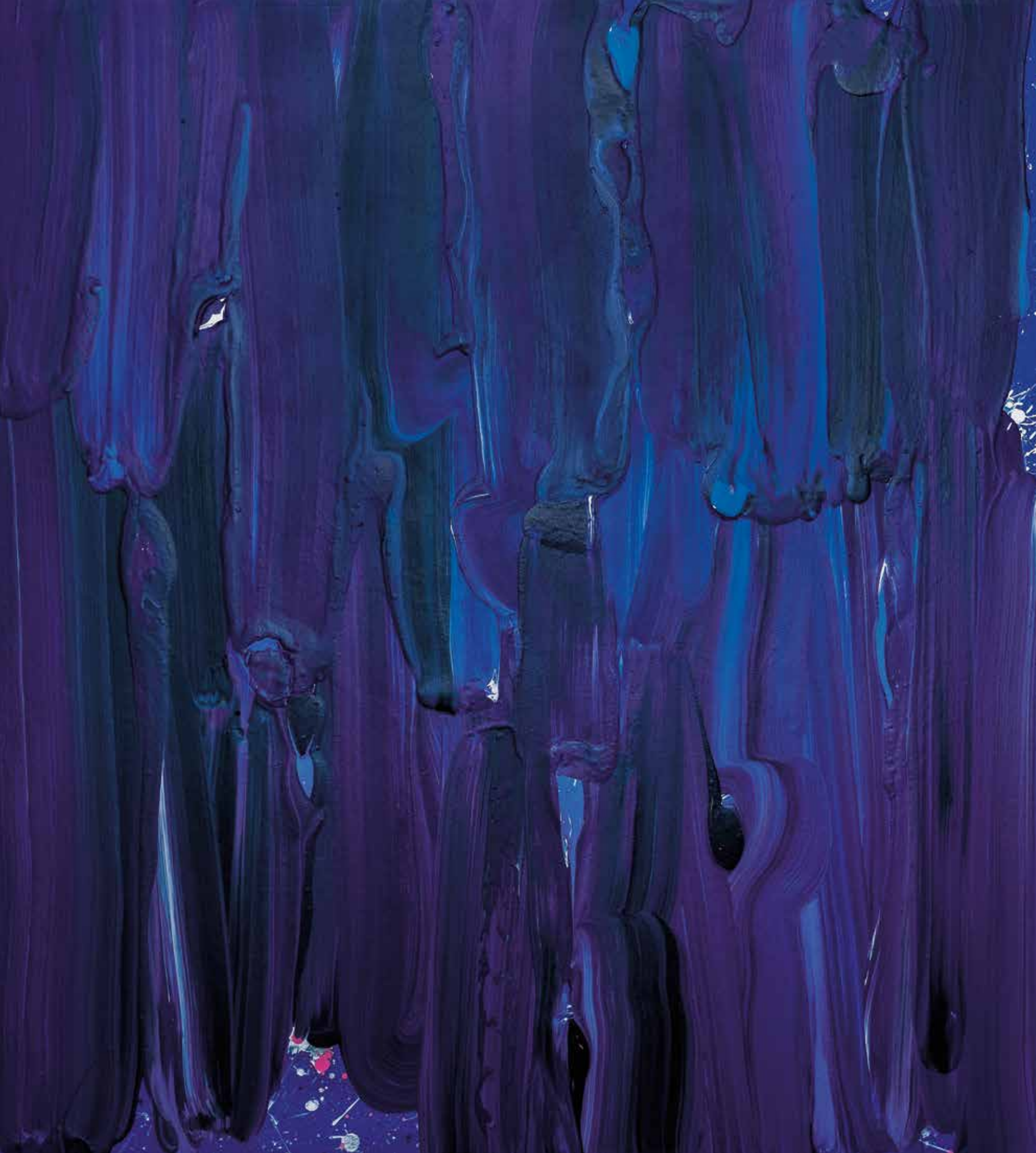
< Sortir de l'ordinaire , 2022 130x120 cm, acrylic on canvas