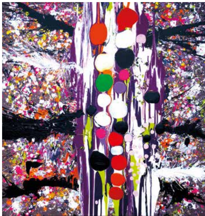
L'impermanence des choses, 2022 150x140 cm, acrylic on canvas