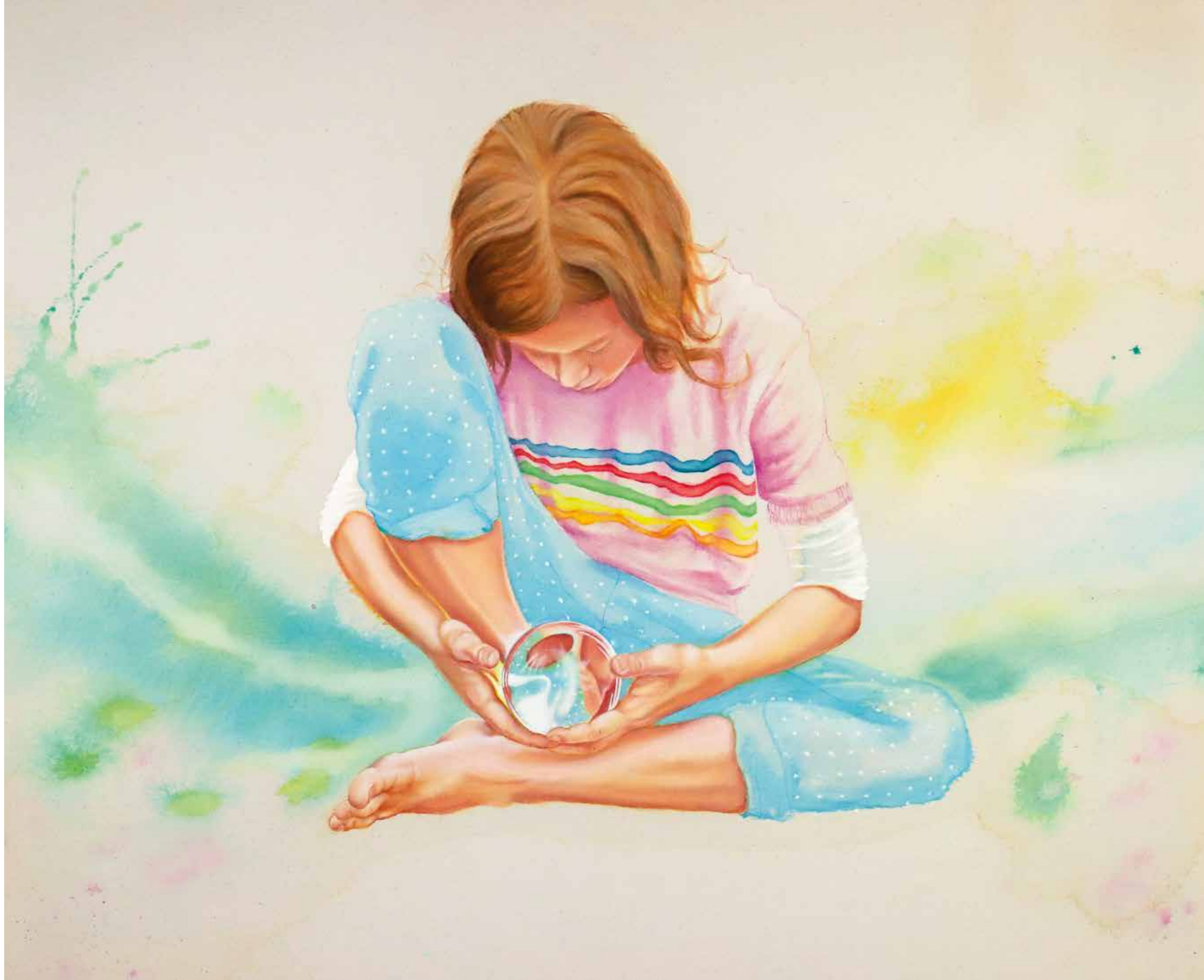
Sternstunde, 2020 80x100 cm, acrylic on untreated canvas