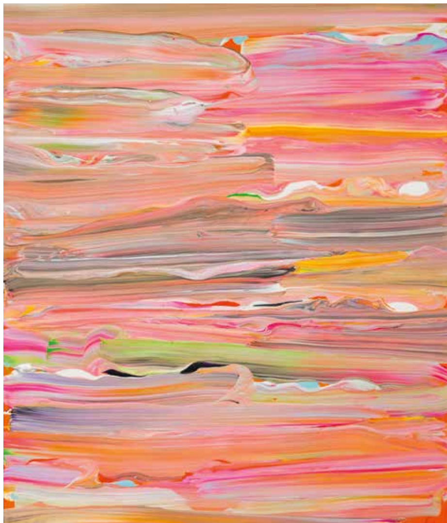
Puisse ton intuition te porter vers le bonheur, 2022 150x120 cm, acrylic on canvas