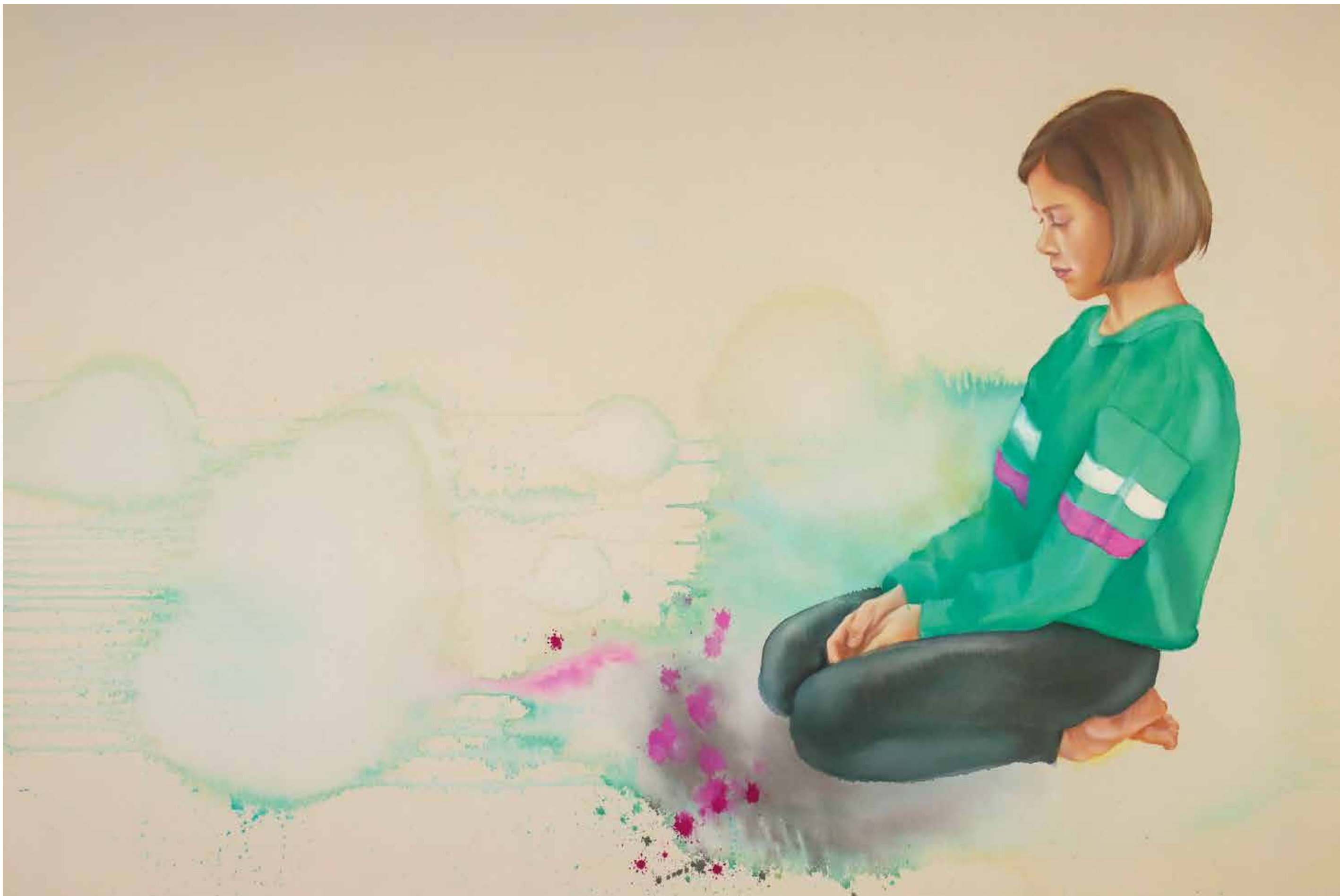
Warten II, 2020 80x120 cm, acrylic on untreated canvas