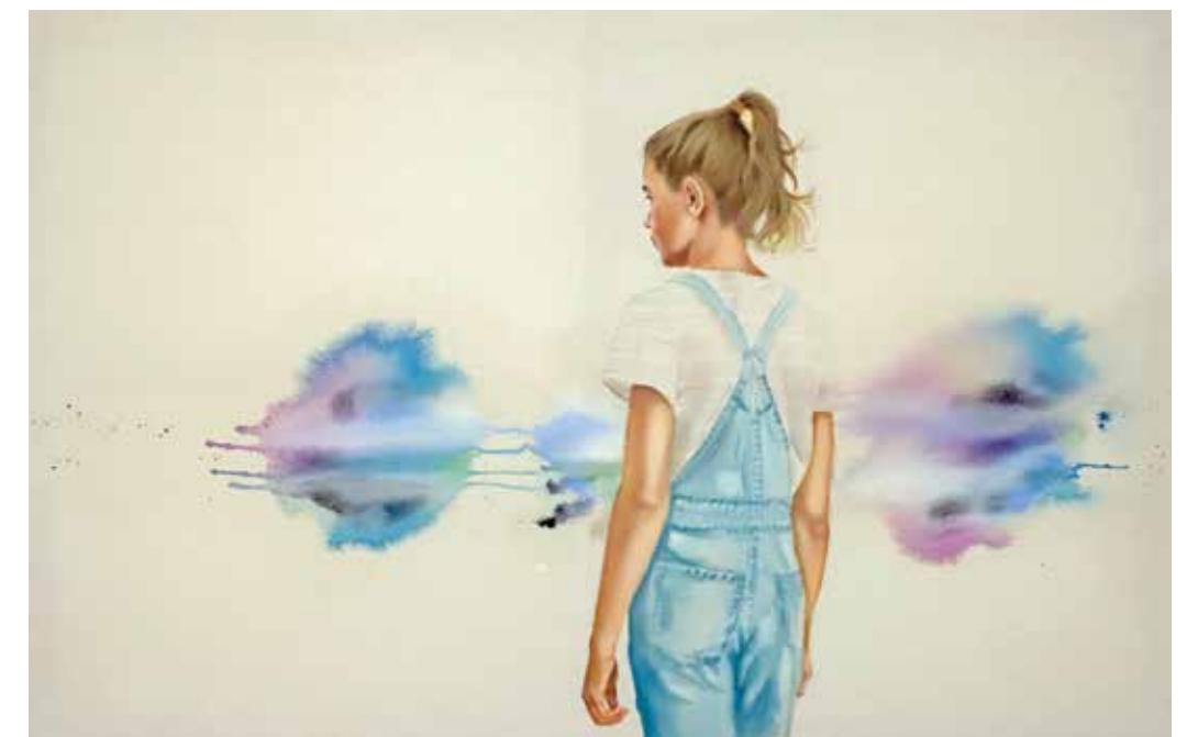
Der Klang der Stille V, 2021 90x140 cm, acrylic on untreated canvas