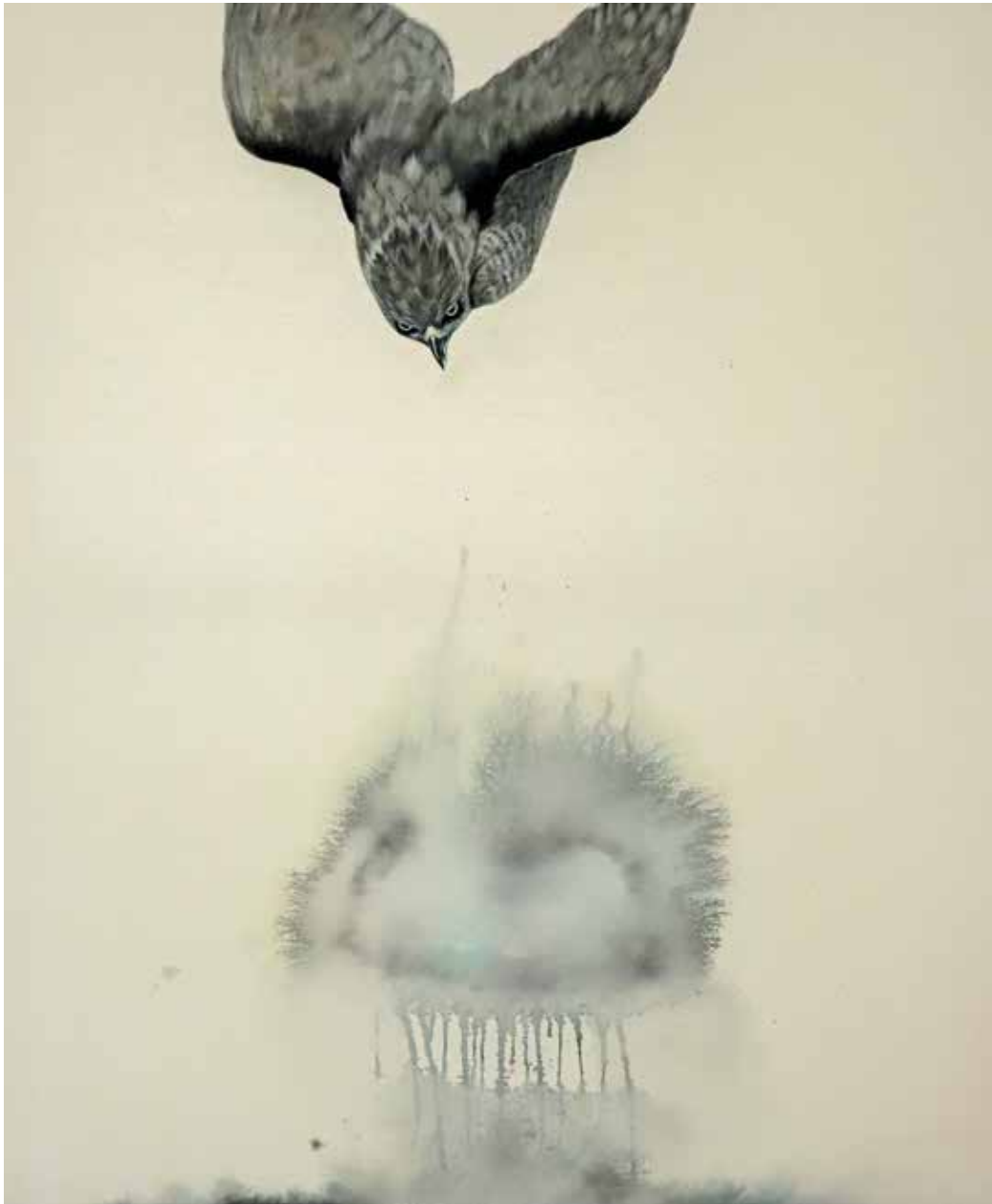
Tieflug II , 2021 120x100 cm, acrylic on untreated canvas