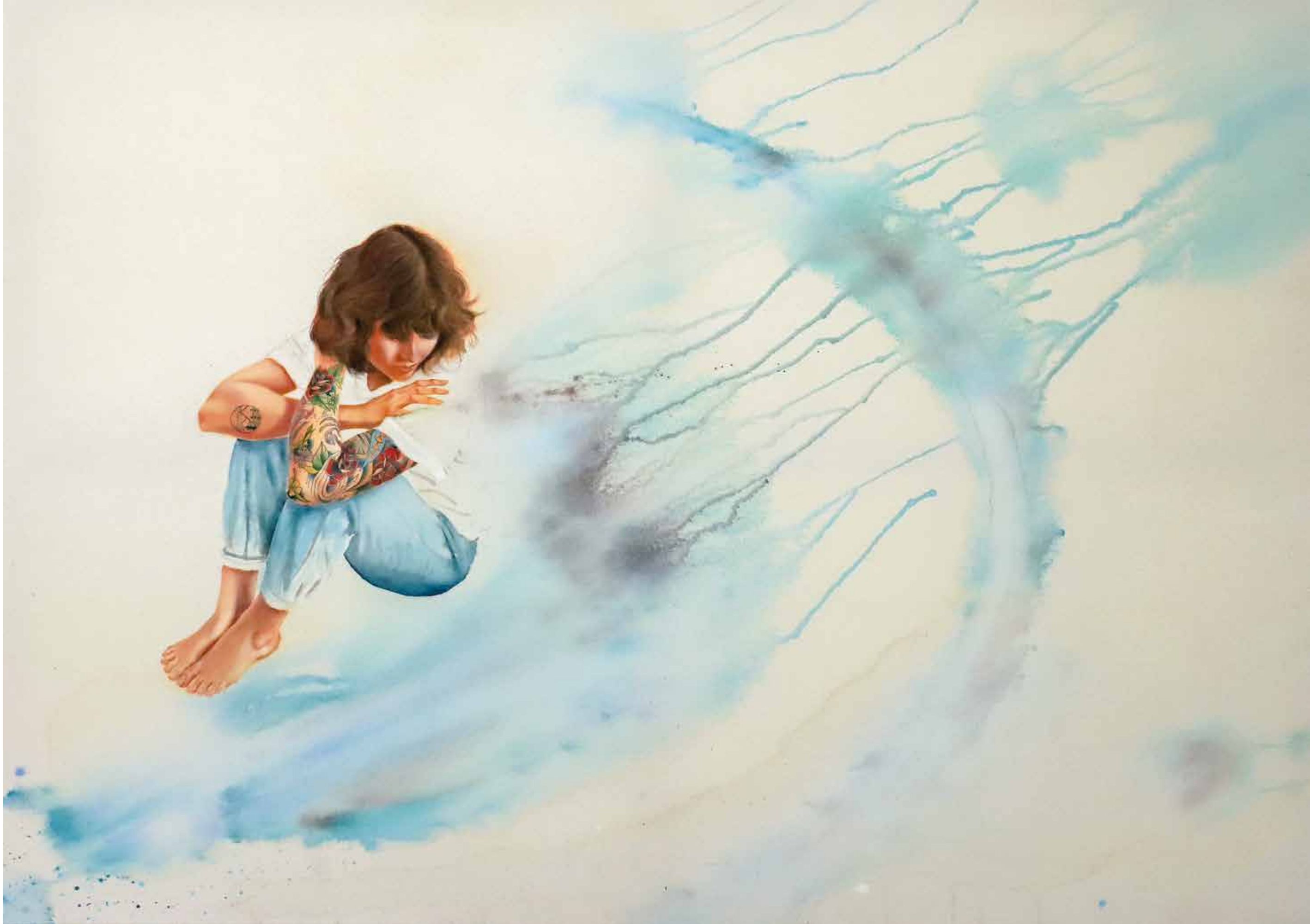
Der Fluss, 2021 120x165 cm, acrylic on untreated canvas