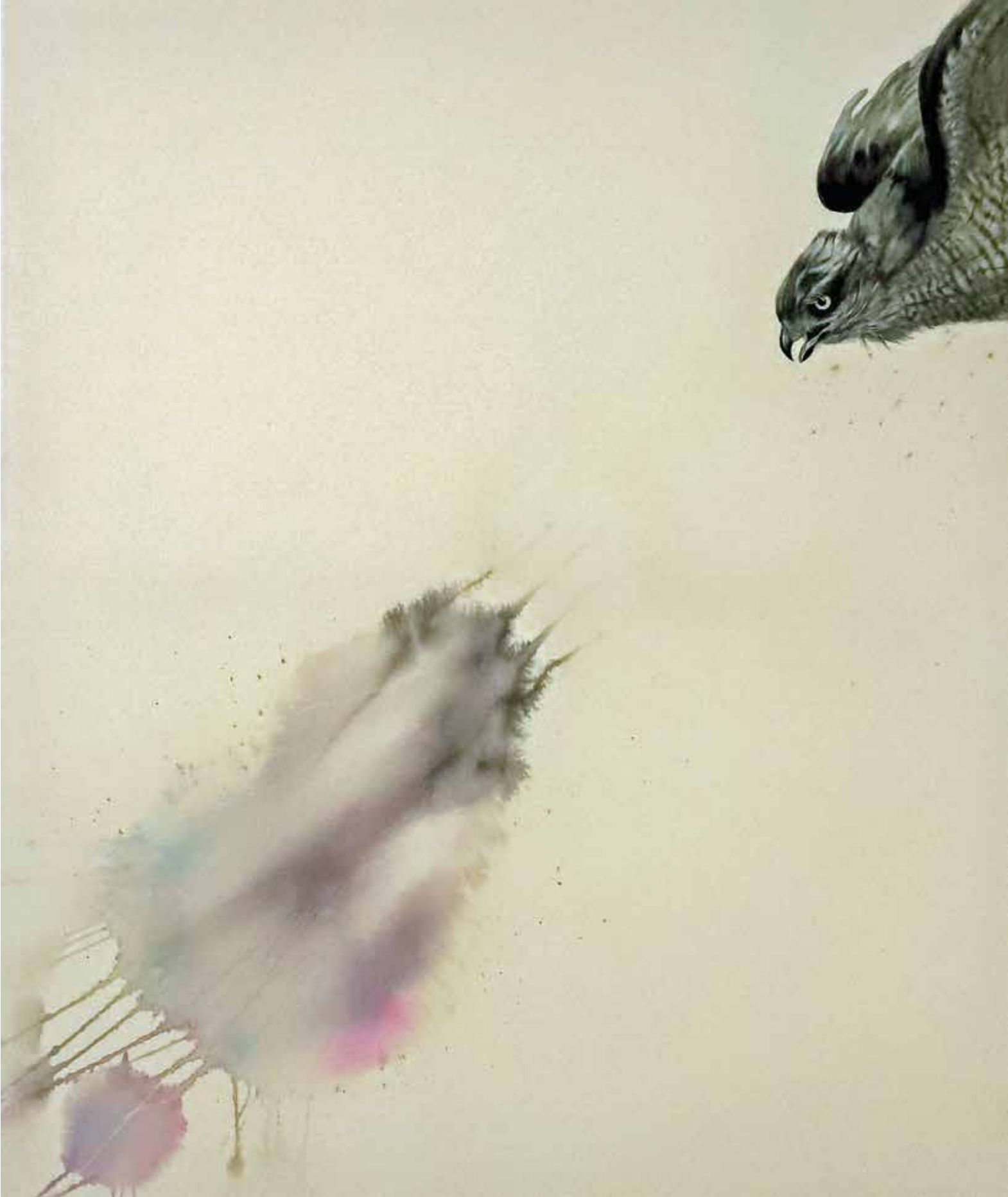
Tieflug III , 2021 120x100 cm, acrylic on untreated canvas