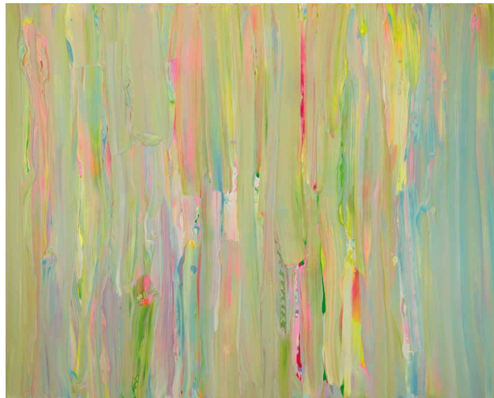
Thru the glass, 2022 160x200 cm, acrylic on canvas