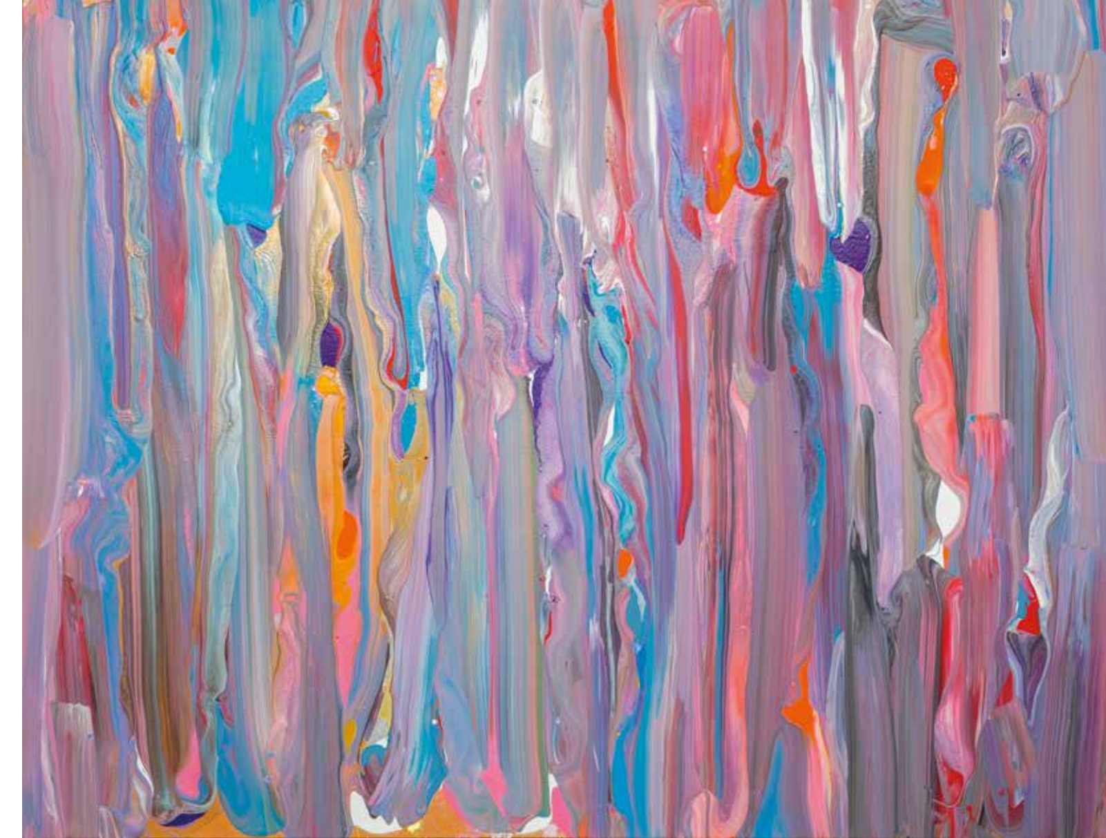
< Right beside you, 2022 150x120 cm, acrylic on canvas