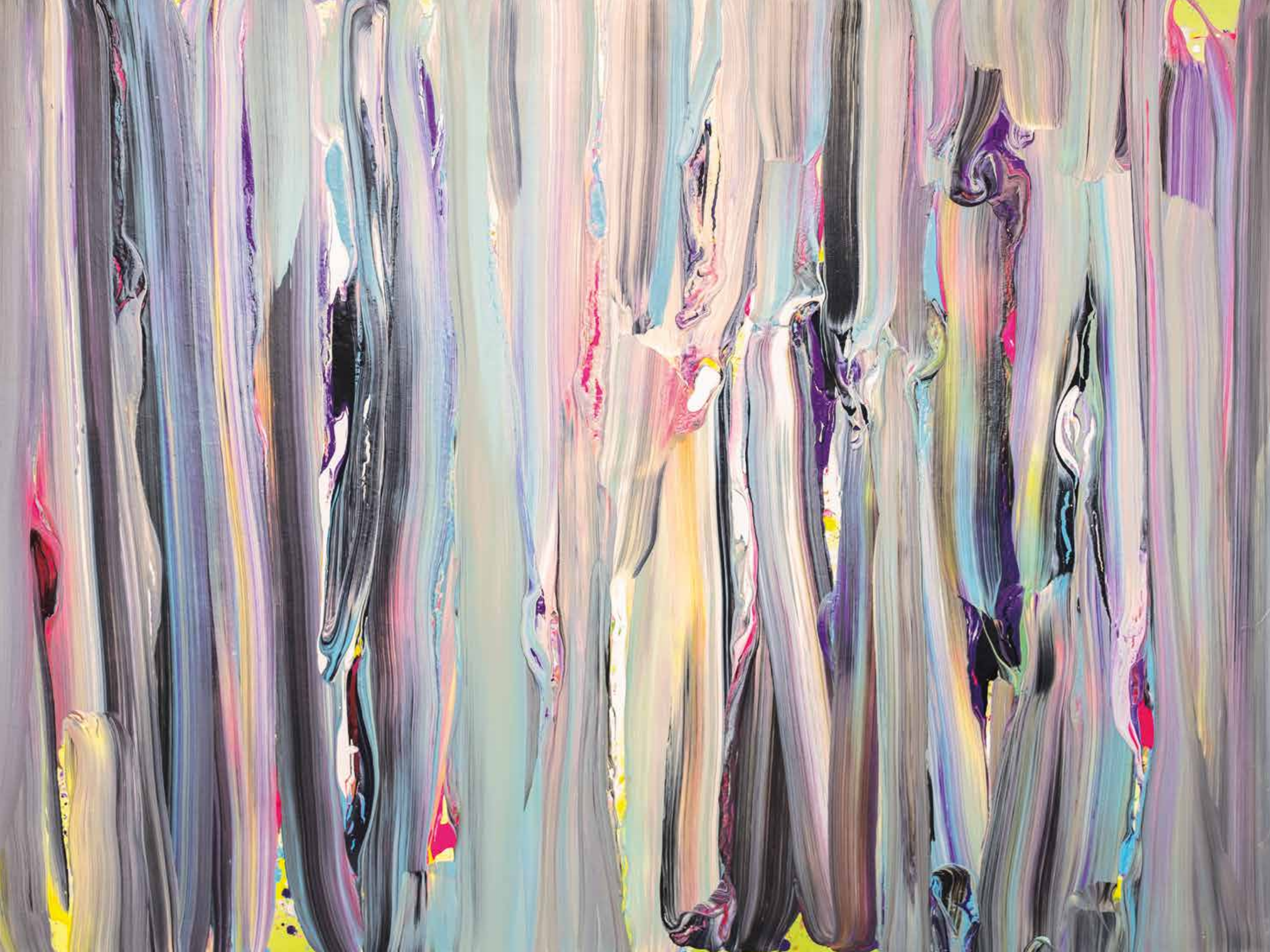
Still a long way to go, 2022 150x200 cm, acrylic on canvas