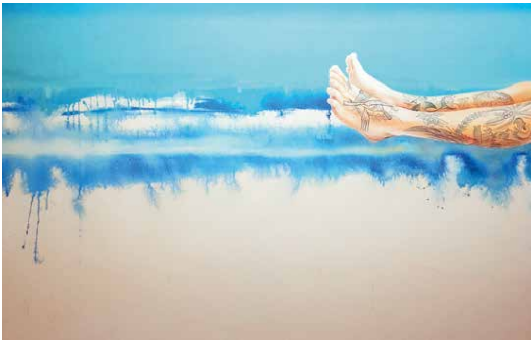
Schmetterling , 2021 80x120 cm, acrylic on untreated canvas