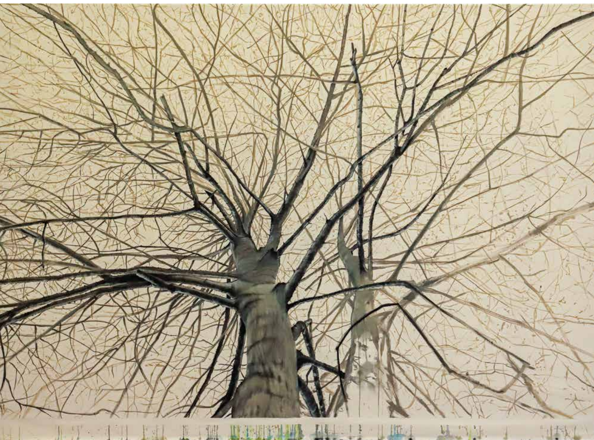
Landschaft Skizze, 2021 153x214 cm, acrylic on untreated canvas