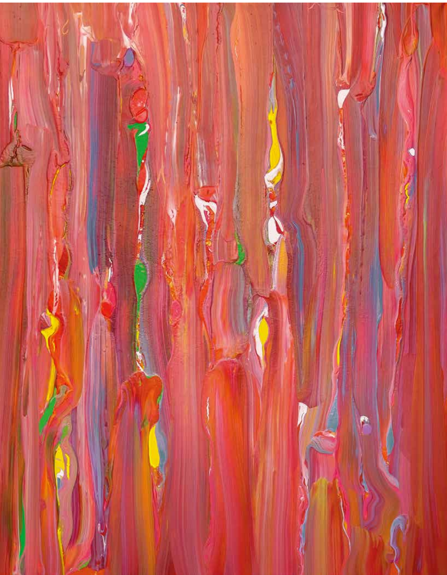
< This is what you wanted, 2022 180x140 cm, acrylic on canvas