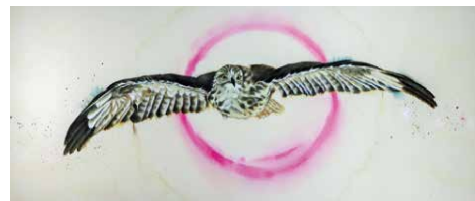
Nachtsegler II, 2020 80 x 190 cm, acrylic on untreated canvas